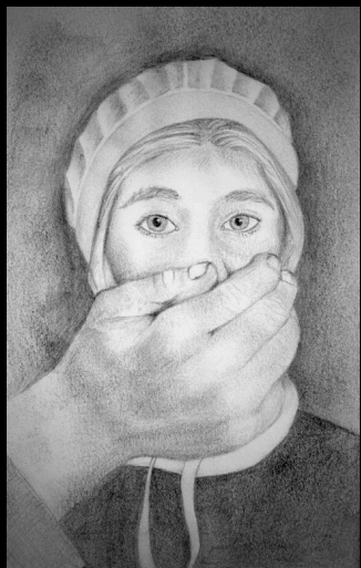
KEN MEH VON DES No More of This